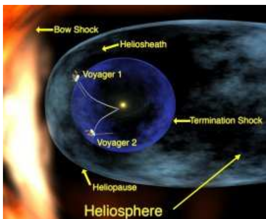
The anatomy of the heliosphere. Since this illustration was made, Voyager 2 has joined Voyager 1 inside the heliosheath, a thick outer layer where the solar wind is slowed by the pressure of interstellar gas. [larger image]